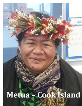
Metua - Cook Island